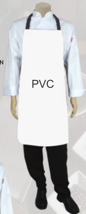
AXFWAPRON PVC FULL FRONT 70W X 110Hcm • WHITE