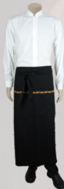
AT509 - 93cm Long WAITERS WRAP APRON WITH REAR MITRED CORNERS AT509B - 79cm Long • ALL COLOURS