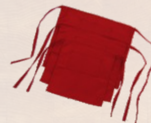
EC8K KIDS HALF APRON WITH RECTANGLE POCKET