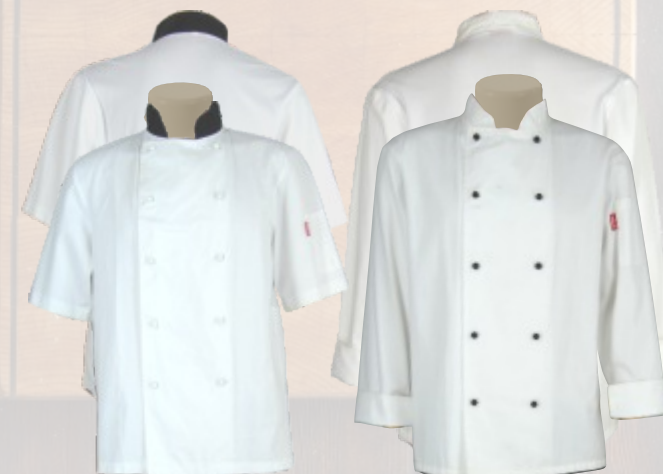
EC35 - CHEFS JACKET BASIC, 1/2 BREATHABLE BACK S/S