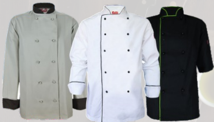
EC2 - EXEC CHEF JACKET, D/BREASTED, CONTRAST COLLAR & UNDER CUFFS, L/S