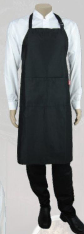
AT919 EXEC BIB APRON LARGER 85X106cm, WITH FRONT POCKET & ADJUSTABLE NECK STRAP 85W X 106Lcm • ALL COLOURS