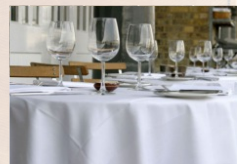
AXTOTC300C 143 X 300cm TABLECLOTH • ALL COLOURS