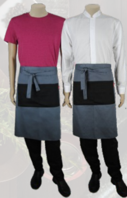
AT1048 HALF APRON WITH FRONT TIES AND A CONTRAST POCKET 63W X 80Lcm • ALL COLOURS