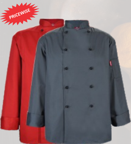
AXTO1 - CHEFS JACKET, BASIC, D/BREASTED, L/S, WHITE OR BLACK POPPERS