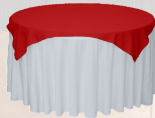
AXTOOL90C 90 X 90cm OVERLAYS • ALL COLOURS