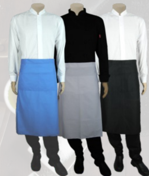
AXTO8 HALF APRON WITH RECTANGLE POCKET 98W X 77Lcm • ALL COLOURS • STOCK EP8 WHITE • STOCK EP8 BLACK