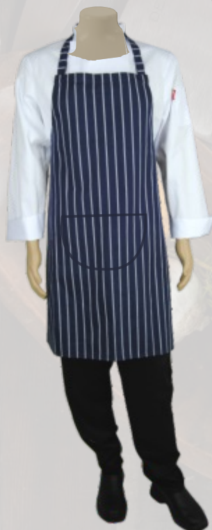
AXTO9 FULL FRONT BIB APRON WITH ROUND POCKET & NECK ADJUSTER • ALL COLOURS • STOCK EP9 WHITE • STOCK EP9 BLACK • STRIPES OR CHECKS