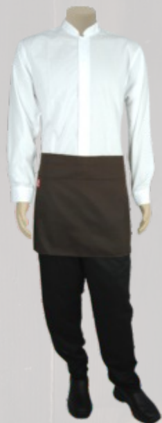
AXTO33 BAR APRON WITH POCKET 59W X 46Lcm • ALL COLOURS