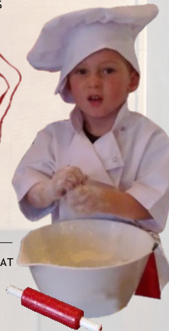
EC5K - KIDS MUSHROOM HAT WITH VELCRO ADJUSTER