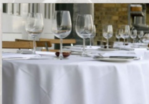
AXTOTC200C 143 X 200cm TABLECLOTH • ALL COLOURS