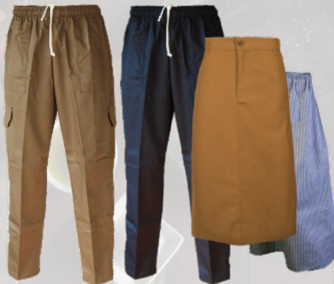
AXT011B UNISEX CARGO ELASTICATED PANTS WITH 3 POCKETS & DRAWCORD & WITH CARGO POCKETS