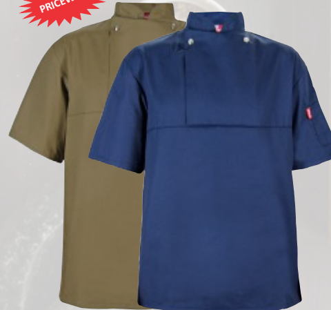
AXTO17 - CHEFS FLAP SHIRT WITH PRESS STUDS, S/S