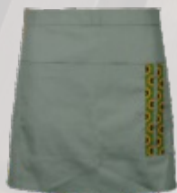
EC33A HALF APRON WITH Twill POCKET STRIPES 54W X 46Lcm • ALL COLOURS