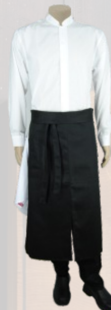
AT953 FOLD OVER WAITERS APRON, FRONT SPLIT, SIDE POCKET, FRONT TIES & CLOTH LOOP 96W X 89Lcm