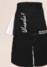
AT953B WAITERS FOLD OVER APRON FRONT SPLIT, SIDE POCKET, FRONT TIES & CLOTH LOOP, 2 TONE 96W X 89Lcm