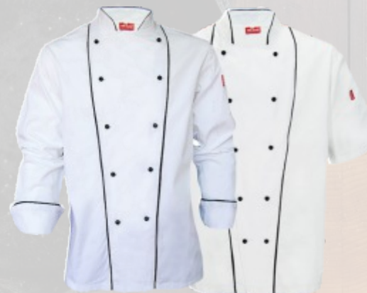
EC3 - EXEC CHEFS JACKET, D/BREASTED, COLLAR, CUFFS & DOUBLE FRONT PIPING, UNDERARM EYELETS, L/S