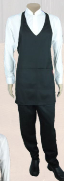
EC41A TUXEDO APRON WITH FRONT POCKET • ALL COLOURS