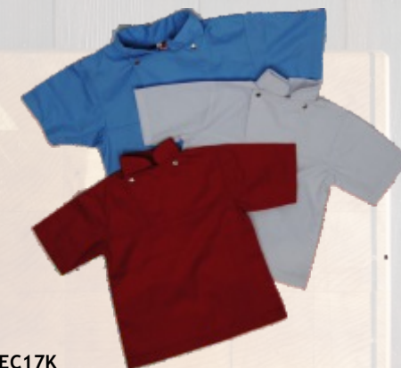
EC17K KIDS CHEFS FLAP SHIRT WITH PRESS STUDS & SHORT SLEEVES