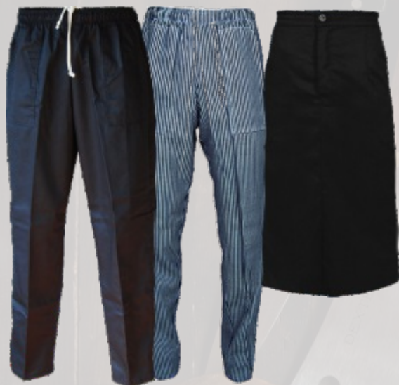
EP40 LADIES HALF ELASTICATED SKIRT WITH BUTTON & ZIP • BLACK