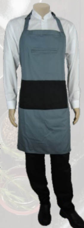
AT1050 FULL FRONT BIB APRON WITH CONTRAST WIDE POCKET & TOP METAL HORIZONTAL ZIP DETAIL • ALL COLOURS