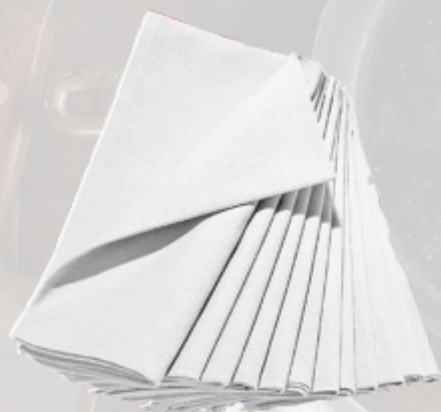
AXTONP40C 40 X 40cm NAPKINS • ALL COLOURS