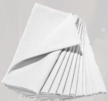
AXTONP30C 30 X 30cm NAPKINS • ALL COLOURS