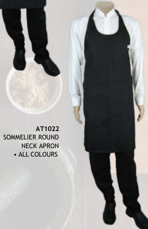
AT1022 SOMMELIER ROUND NECK APRON • ALL COLOURS