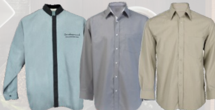
AT1004 BARISTA SHIRT WITH MANDARIN COLLAR & COVERED FRONT BUTTON STAND