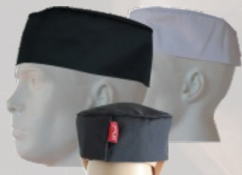
EP6 CHEFS BEANIE WITH TONAL TOPPIPING AND HIDDEN VELCRO CLOSER 7,5H X 18Dcm • BLACK • WHITE