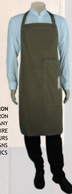
CUSTOM FULL APRON FULL APRON WE CAN DESIGN ANY APRON YOU REQUIRE • ALL COLOURS • ALL DESIGNS • ALL FABRICS