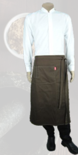
AT1049 WAITERS HALF APRON WITH CONTRASTING STITCHING, 2 PEN SLOTS, OFF-CENTRE POCKET & FRONT TIES • ALL COLOURS