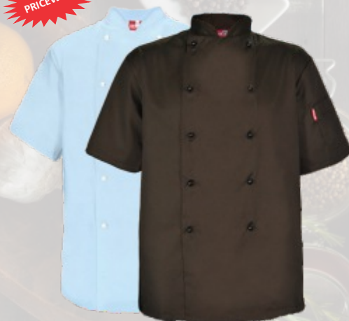
AXTO18 - CHEFS JACKET, BASIC, D/BREASTED S/S, WHITE OR BLACK POPPERS