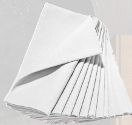
AXTONP50C 50 X 50cm NAPKINS • ALL COLOURS