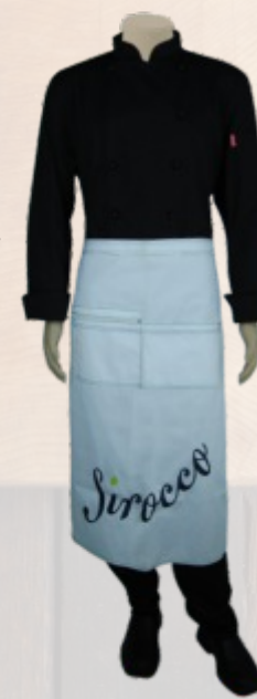
CUSTOM HALF APRON WE CAN DESIGN ANY APRON YOU REQUIRE • ALL COLOURS & DESIGNS