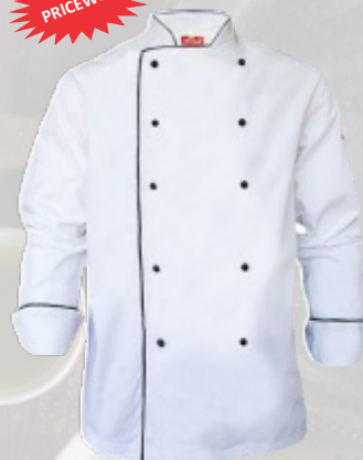
AXTO2B - EXEC CHEFS JACKET, PRICEWISE OPTION, COLLAR, CUFF & FRONT PIPING, L/S