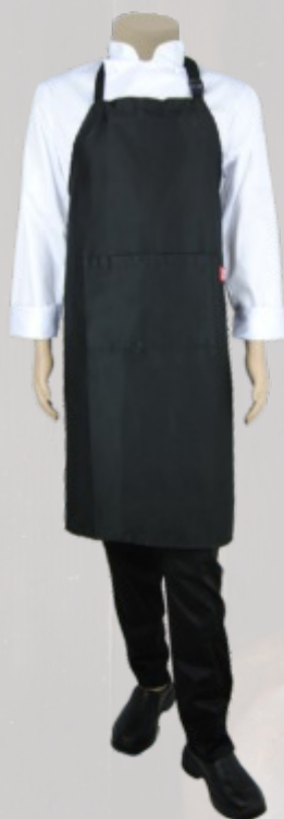
AXTO9 FULL FRONT BIB APRON WITH ROUND POCKET & NECK ADJUSTER • ALL COLOURS • STOCK EP9 WHITE • STOCK EP9 BLACK • STRIPES OR CHECKS