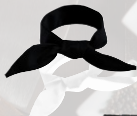
EP7 - BANDANNA OR DOEK, TRIANGULAR 100 X 70 X 70cm • BLACK • WHITE