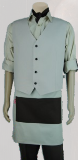
AXCM-TG1-460 TROUSER - PLEATED SERVICE POLYESTER